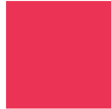
Viva Magenta #EB3455